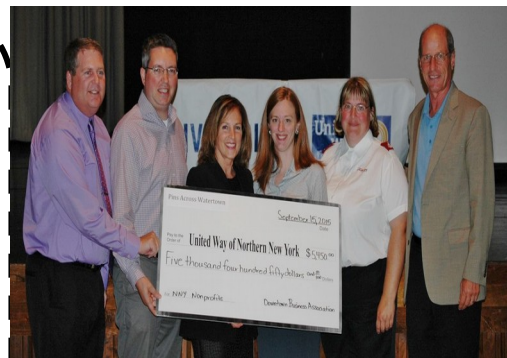
Thank you to the Downtown Business Association of Watertown, who presented five local nonprofits, including your Mission, with a total of $5,450 raised by the Pins Across Watertown event in April during the United Way of NNY kick-off event on September 15, 2015.

Sign up at the Mission's front desk to reserve your spot